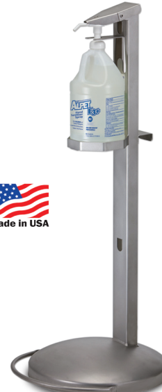
EZ-Step Portable Foot-Activated Dispenser MD10012